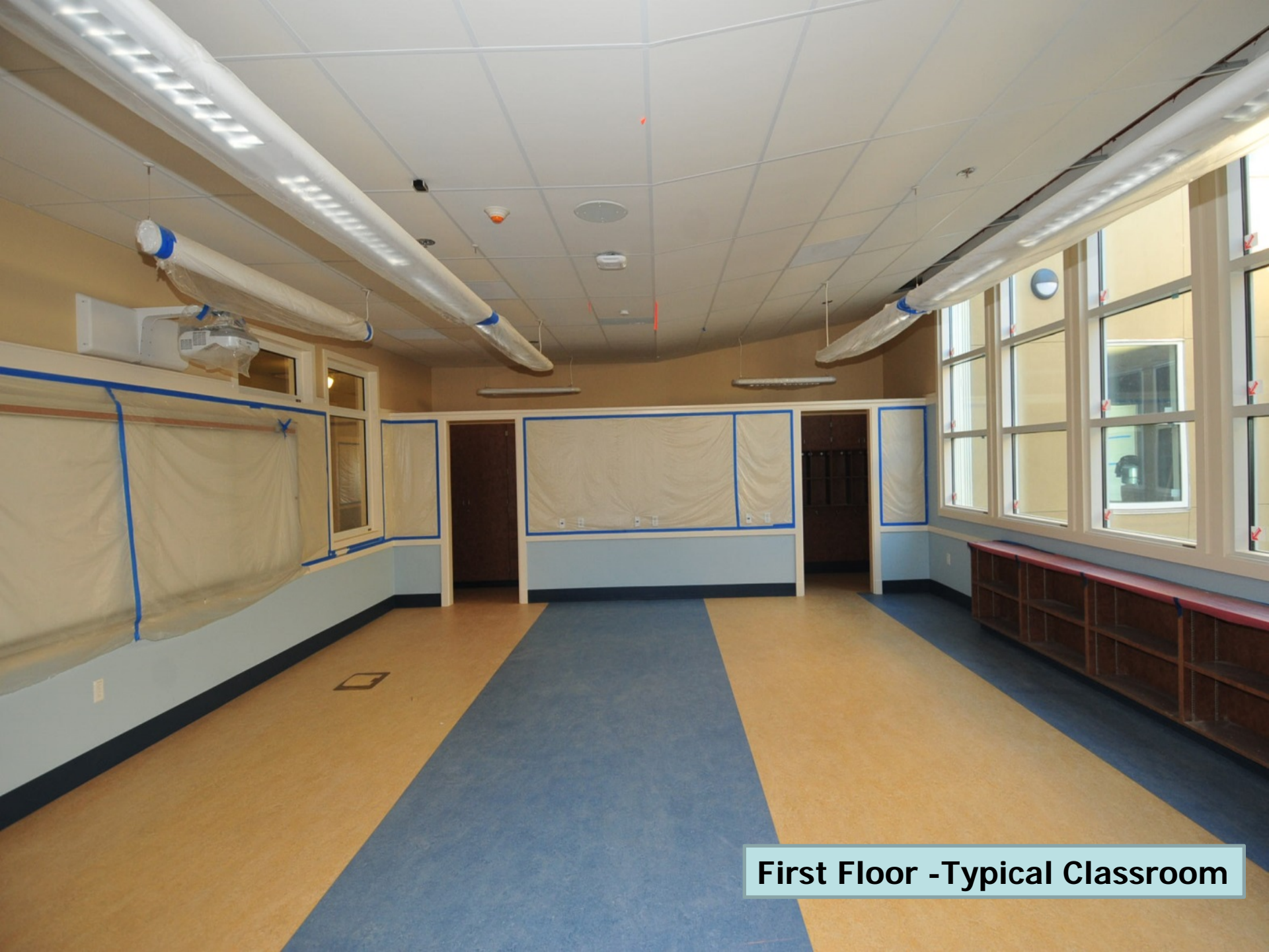
First Floor -Typical Classroom