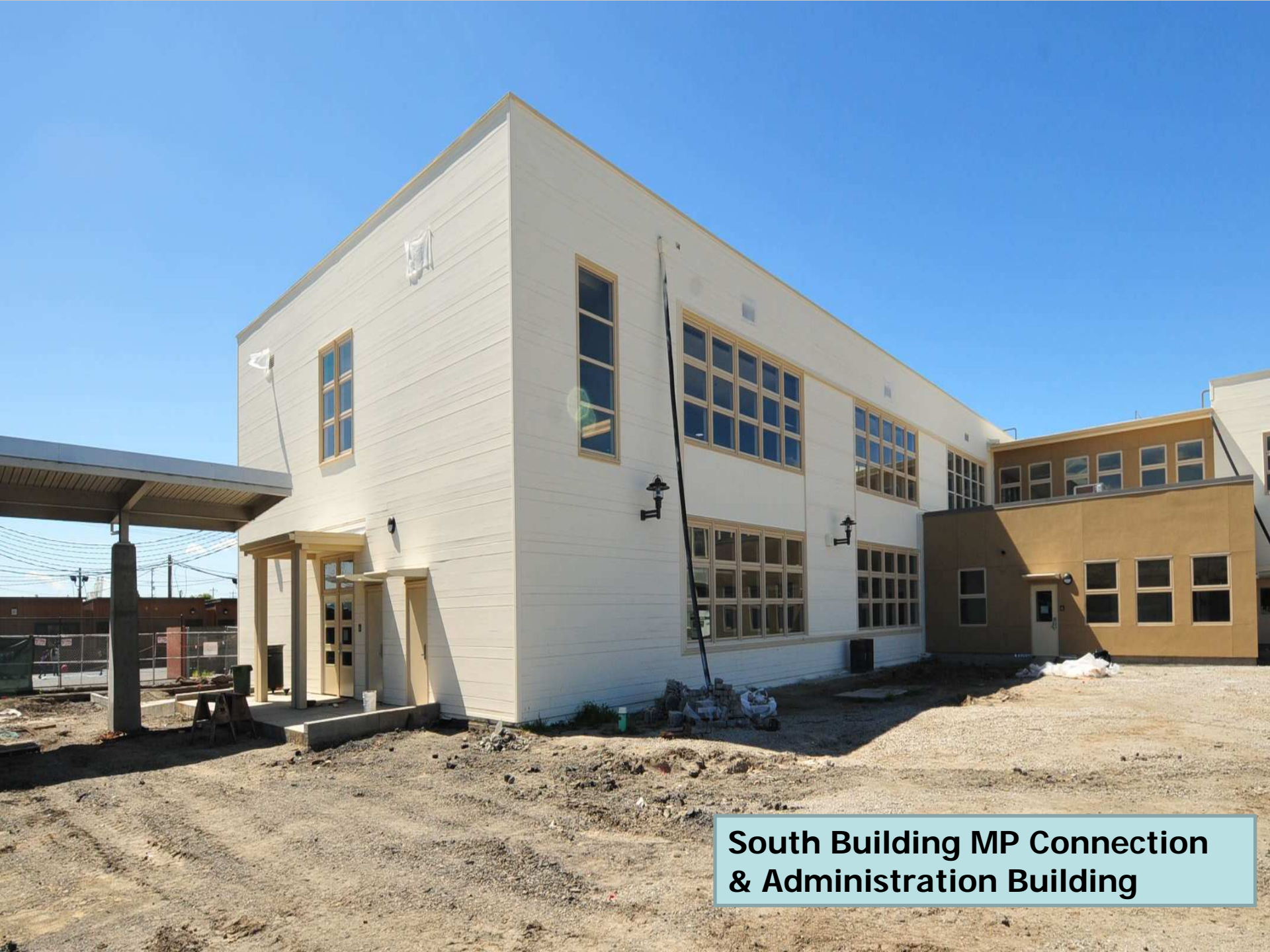
South Building MP Connection & Administration Building