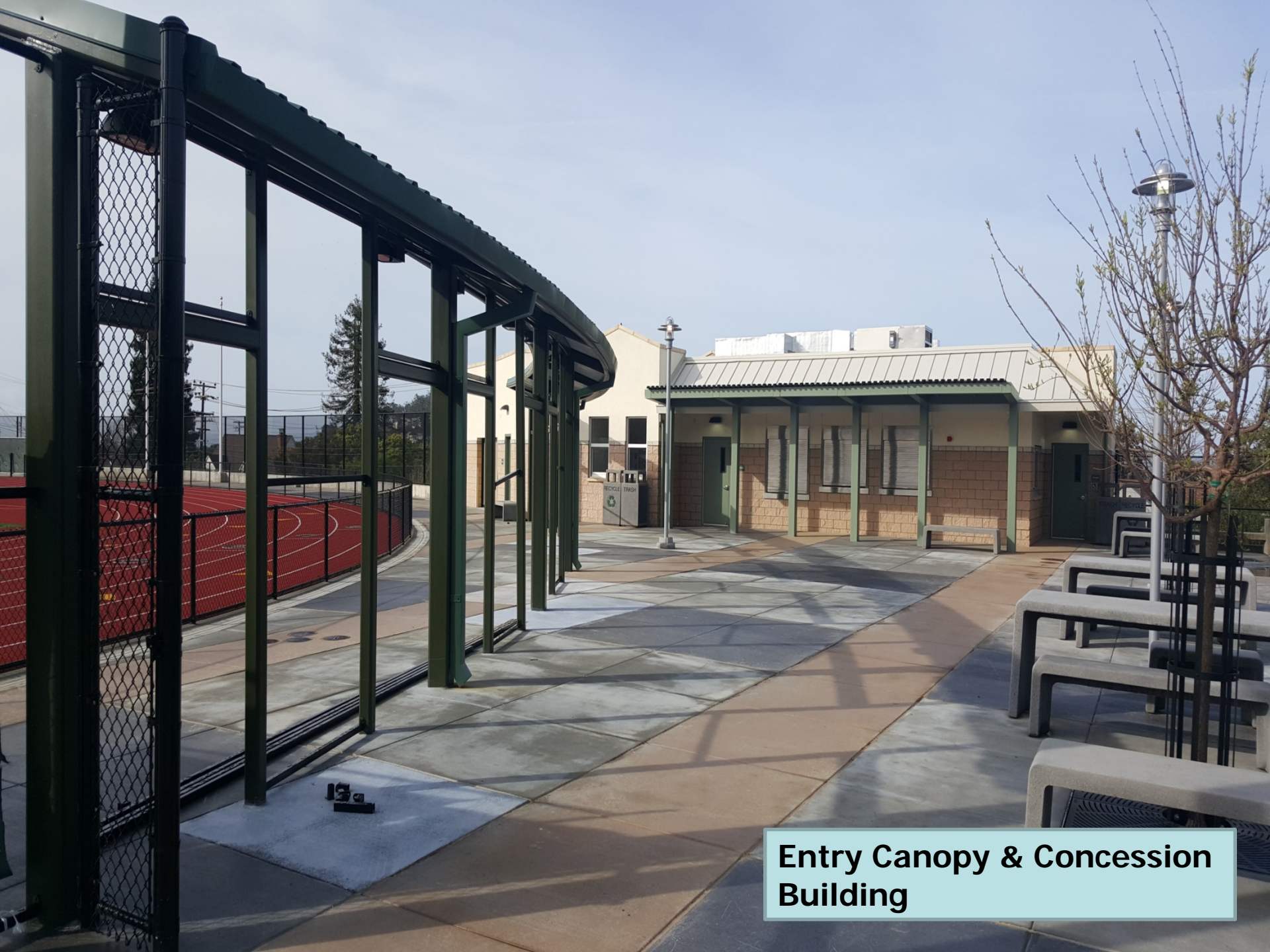
Entry Canopy & Concession Building