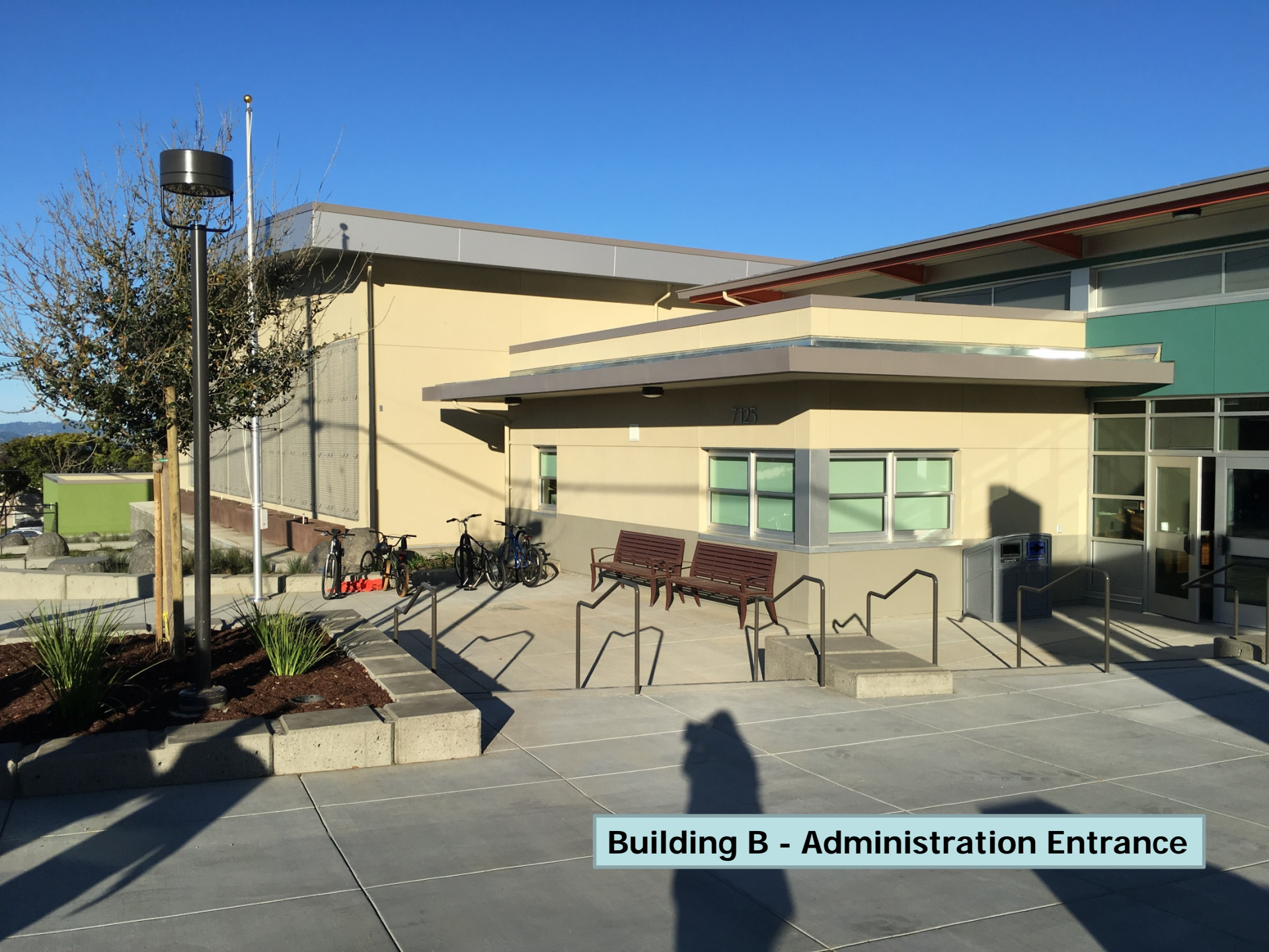
Building B - Administration Entrance